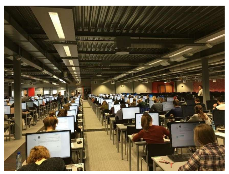
Students taking a mathematics exam with SOWISO

In the current learning age, content cannot be seen separate from technology anymore. T he SOWISO elearning platform, designed for teaching undergraduate mathematics/statistics, combines the best of both